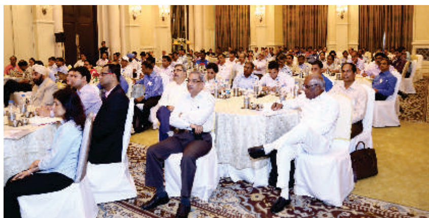
Officers from various Ministries and PSUs at the workshop on Competition Law and Public Procurement organised jointly by CCI and World Bank on August 11, 2017 at New Delhi