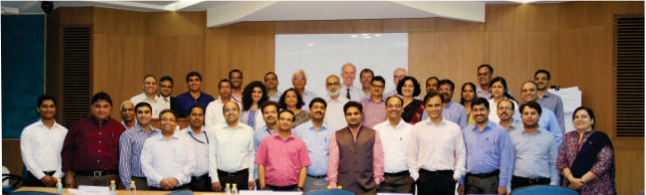
CCI Officers at the First Refresher Course Training Programme

Competition Commission of India The Hindustan Times House 18-20, Kasturba Gandhi Marg New Delhi-110001