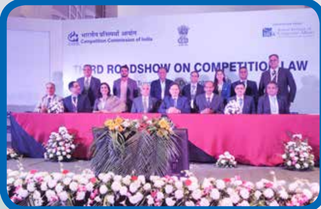
Glimpses of the Third Roadshow