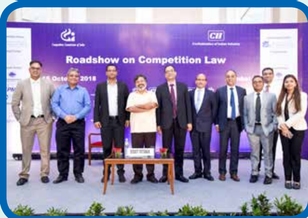
Glimpses of The First Roadshow