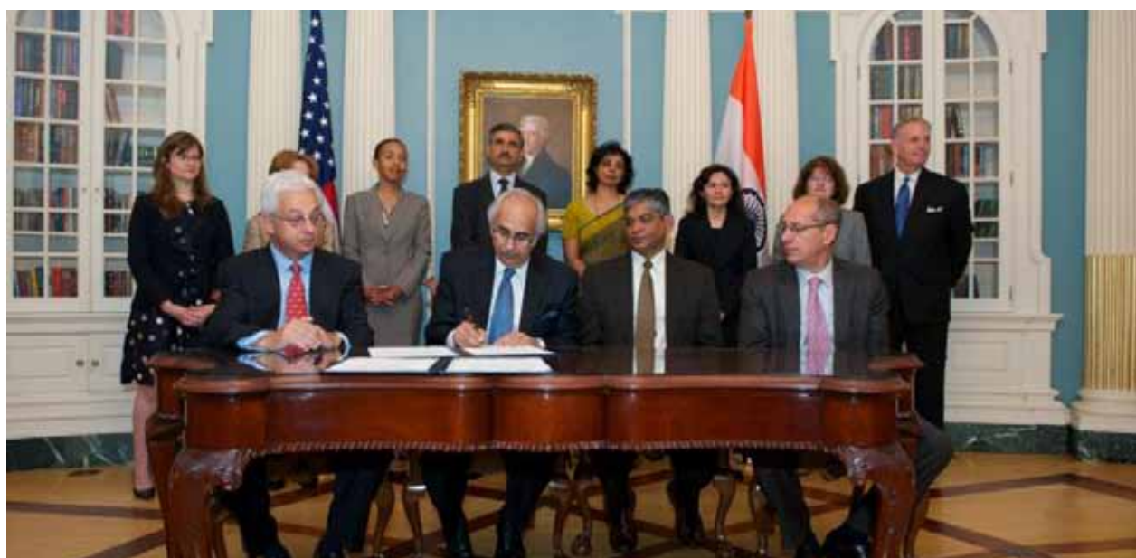
Chairperson CCI signing India-US MOU on Anti-Trust cooperation with US Anti-Trust Agencies on 27, September, 2012 in Washington DC.

CCI has regularly been participating in various workshops, conferences, seminars meetings etc. organised by International Competition bodies viz. ICN, OECD, Global Competition Forum, UNCTAD, BRICS etc. Exposures at such platforms provides vital linkages and inputs and help developing synergies for participating countries