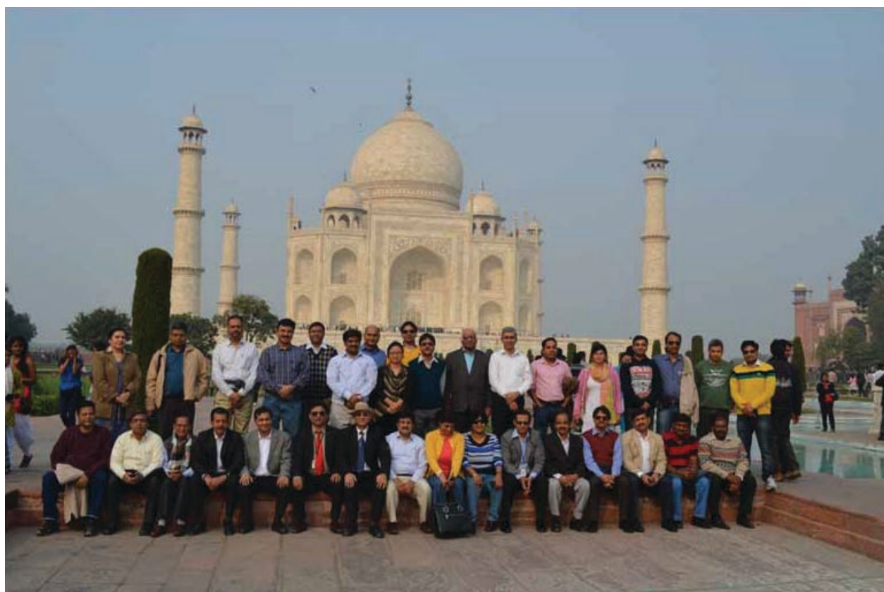
An off-site “Leadership & Team Building” workshop for CCI officials, 14-16, December, 2012 in Agra