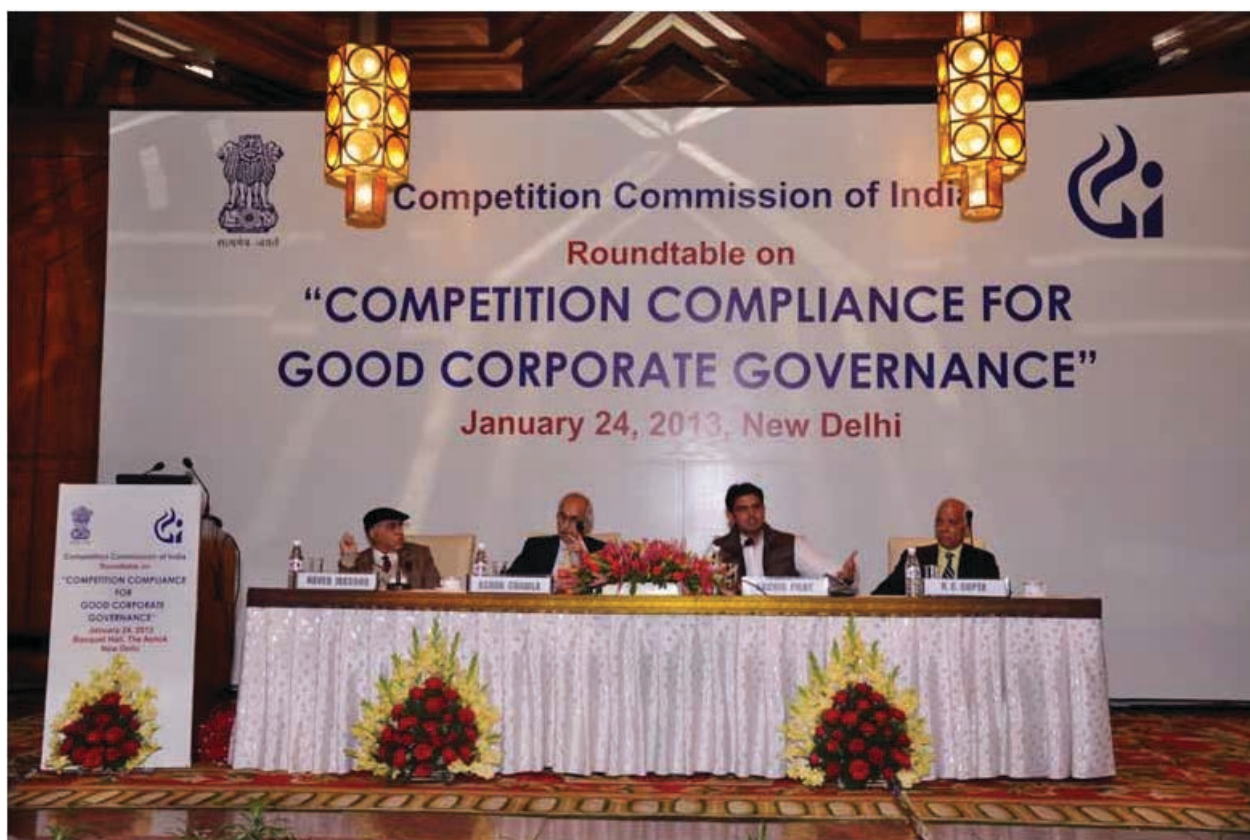
Round Table on “Competition Compliance for Good Corporate Governance” on January 24, 2013 in New Delhi

To supplement the enforcement efforts of the Commission, a large number of initiatives were undertaken in order to foster understanding on the benefits of competition and inculcate a competition culture. The Commission organized workshops, lectures, seminars, conferences, presentations and other interactive sessions with various stakeholders. The topics covered included public procurement, compliance, coherence of policy, and overview of the law.