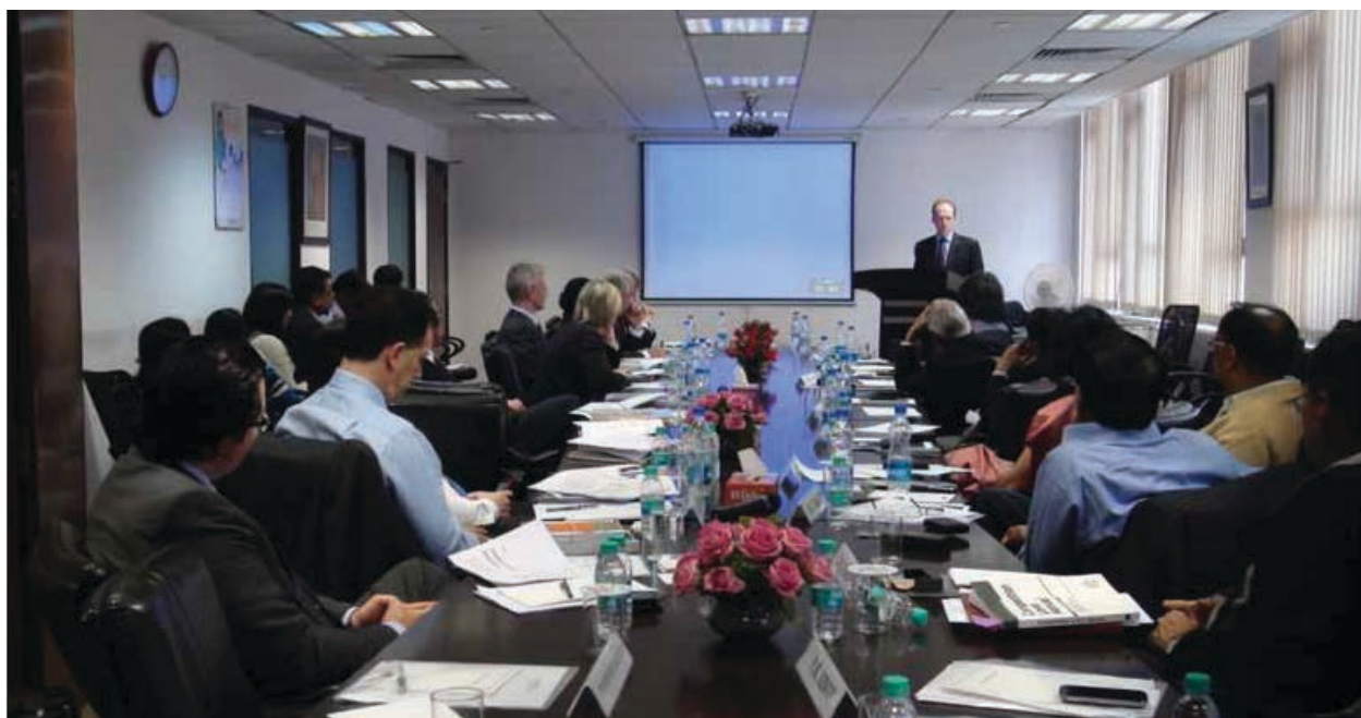
Workshop with US Federal Trade Commission in progress