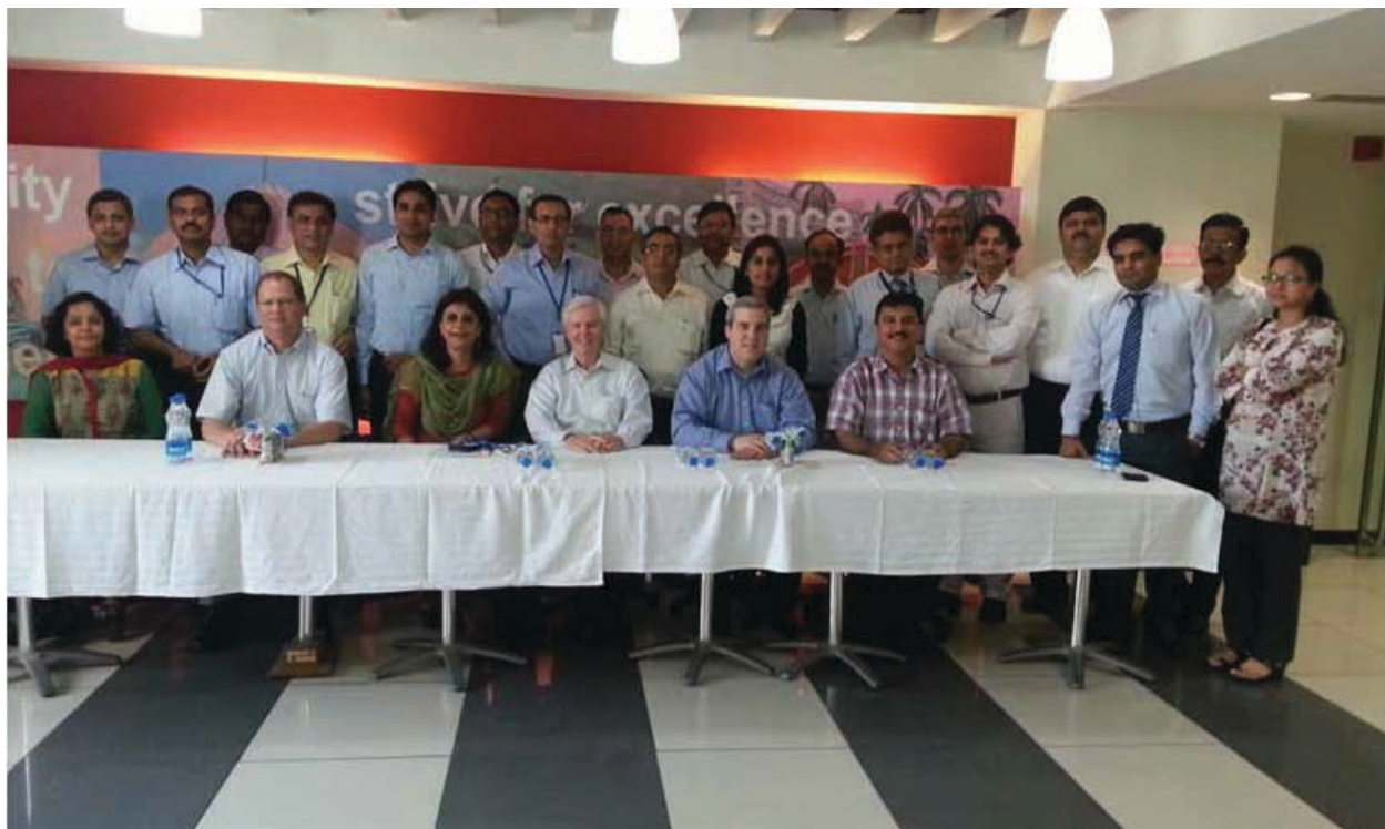
Workshop with US Federal Trade Commission, 24-27 september, 2012 in New Delhi