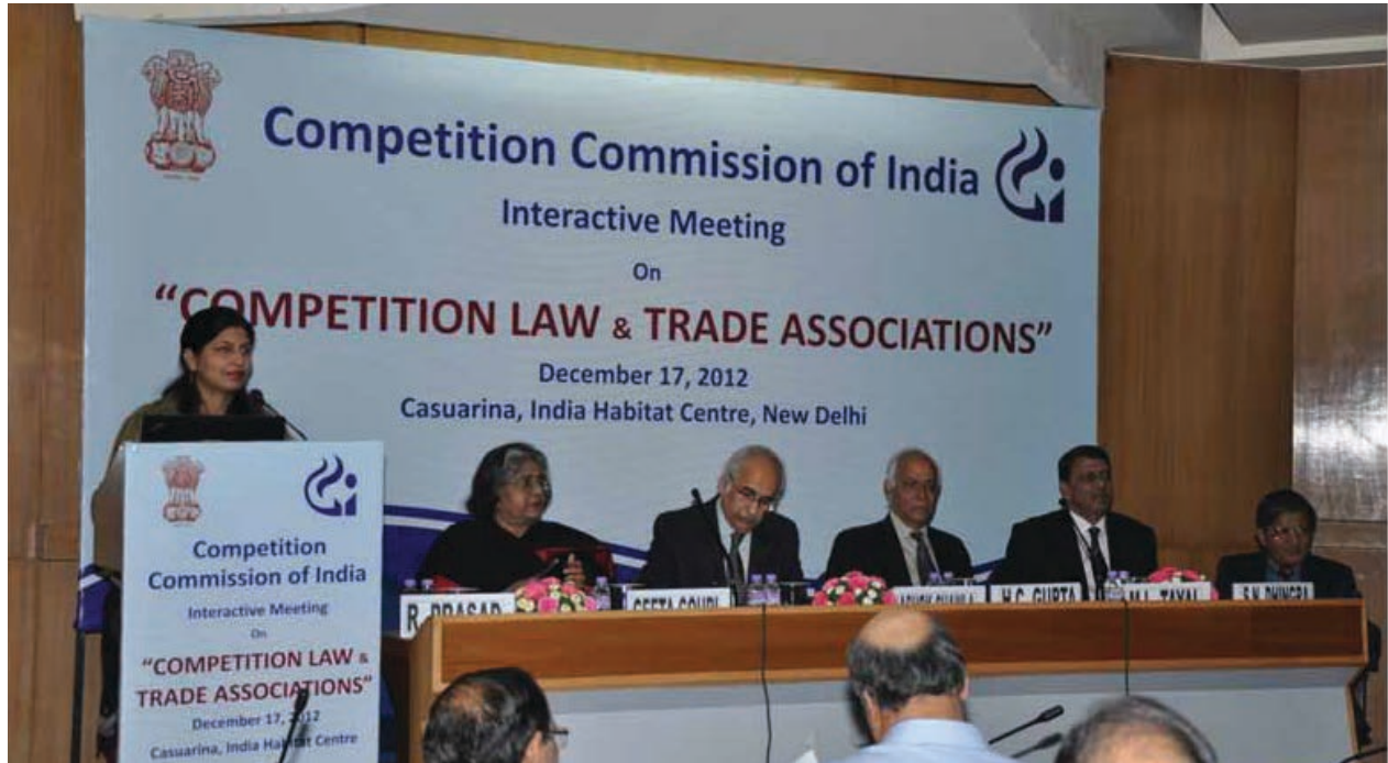
Interactive meeting with various Trade Associations, 17, December, 2012 in New Delhi