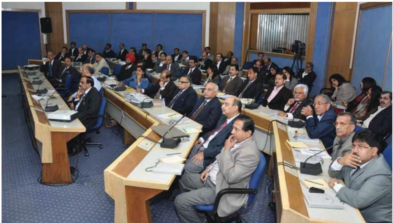
Interactive meeting with various Trade Associations, 17, December, 2012 in New Delhi