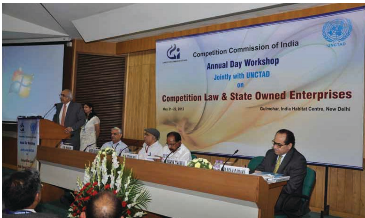
CCI Annual Day Workshop in collaboration with UNCTAD on May 21-22, 2012, in New Delhi