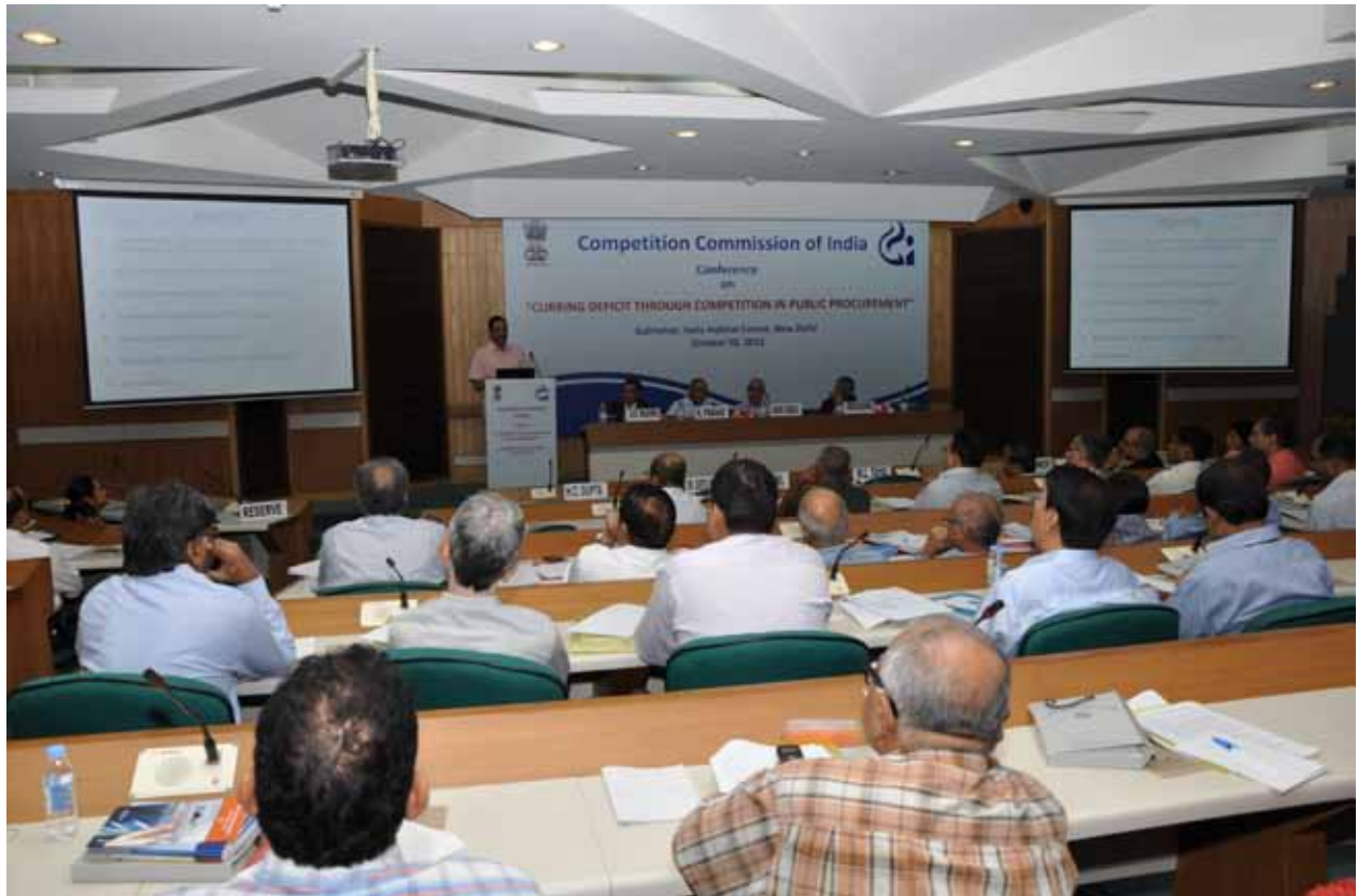
Conference on "Curbing Deficit Through Competition in Public Procurement".