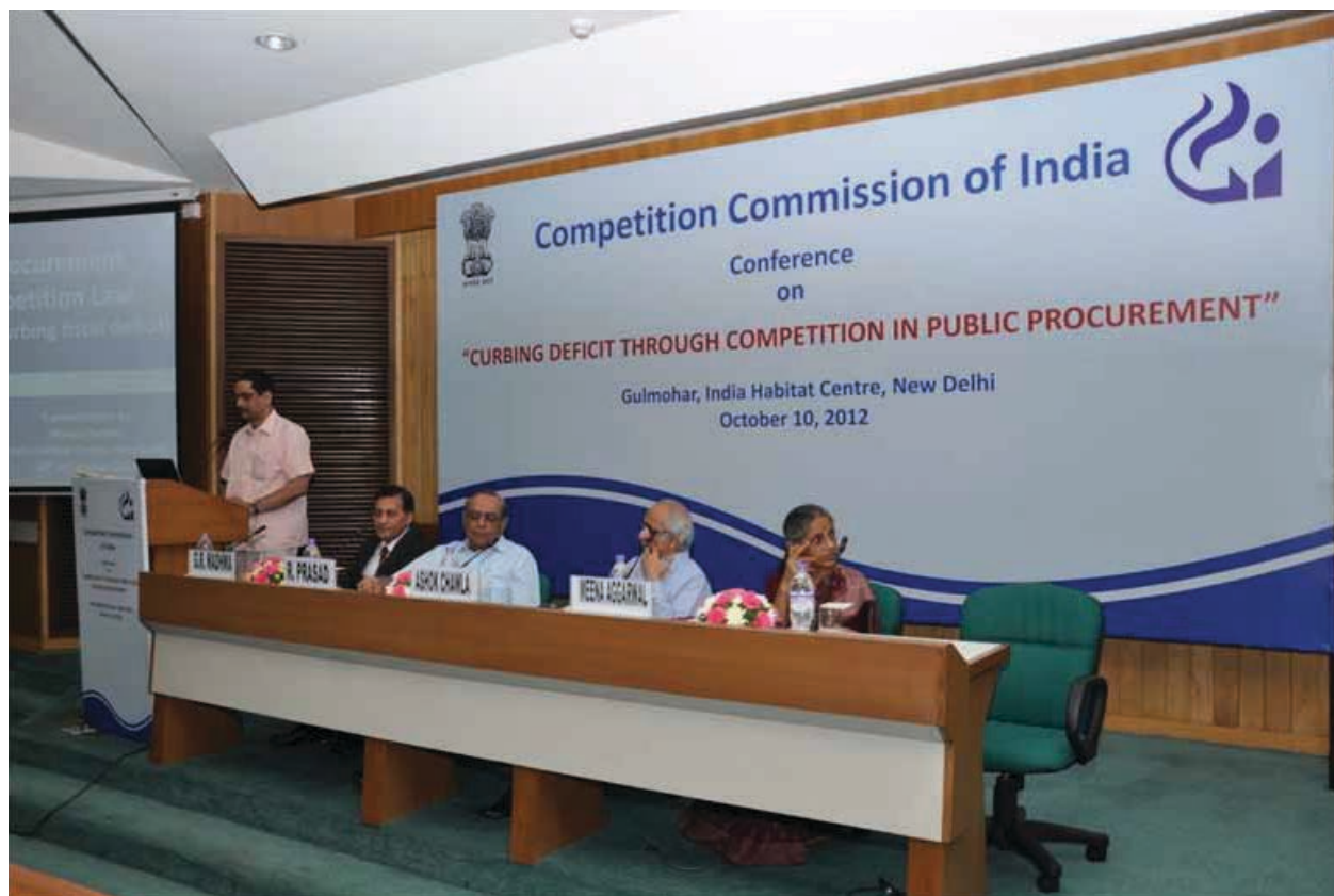
Conference on “Curbing Deficit Through Competition in Public Procurement” 10 th October, 2012 in New Delhi