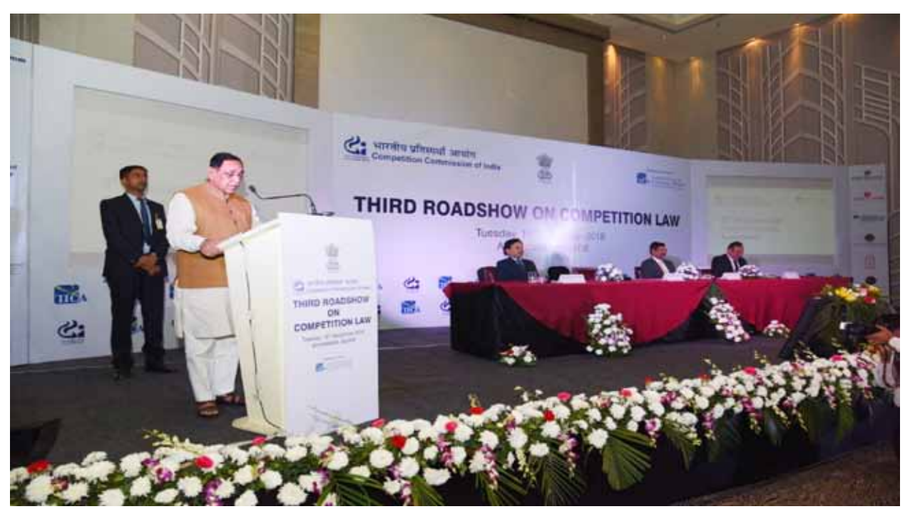
Shri Vijay Rupani, Hon'ble Chief Minister of Gujarat addressing the representatives of various stakeholders' organisation at the third Road Show on Competition Law at Ahmadabad on December 18, 2018.