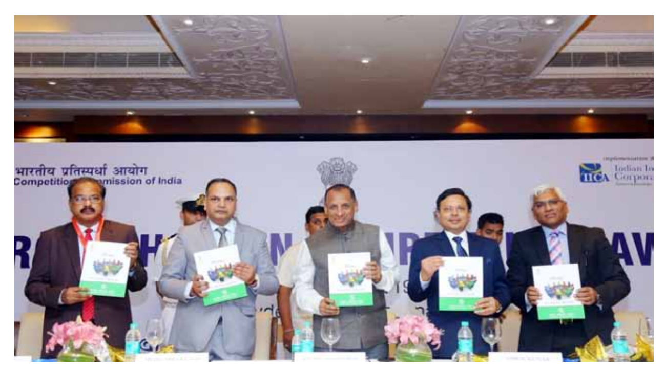
Shri E.S.L. Narasimhan, Hon'ble Governor of Andhra Pradesh was the Chief Guest at the fourth Road Show on Competition Law at Hyderabad on February 25, 2019. On this occasion Hon'ble Governor released telegu version of Competition Advocacy Booklet.