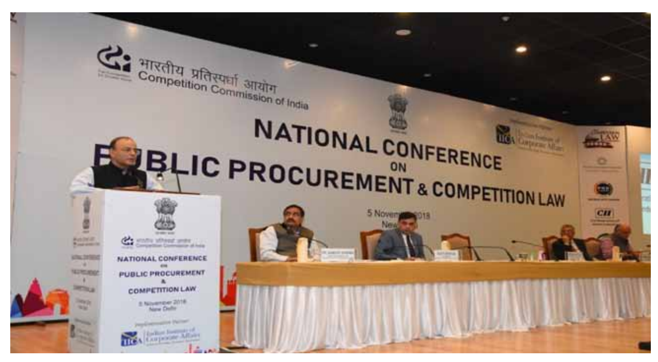
Shri Arun Jaitley, Hon'ble Minister of Finance and Corporate Affairs delivering keynote address as Chief Guest at National Conference on Public Procurement and Competition Law at New Delhi on November 5, 2018.