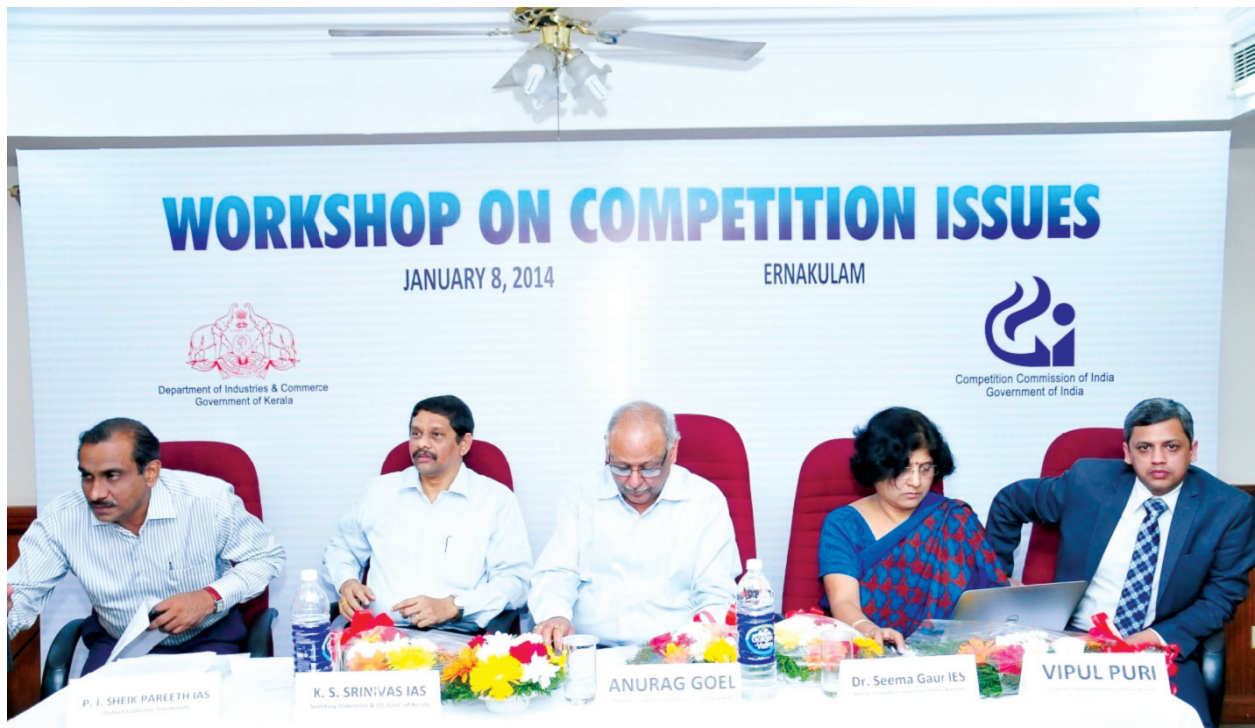
Advocacy Programme under State Government advocacy initiatives in progress