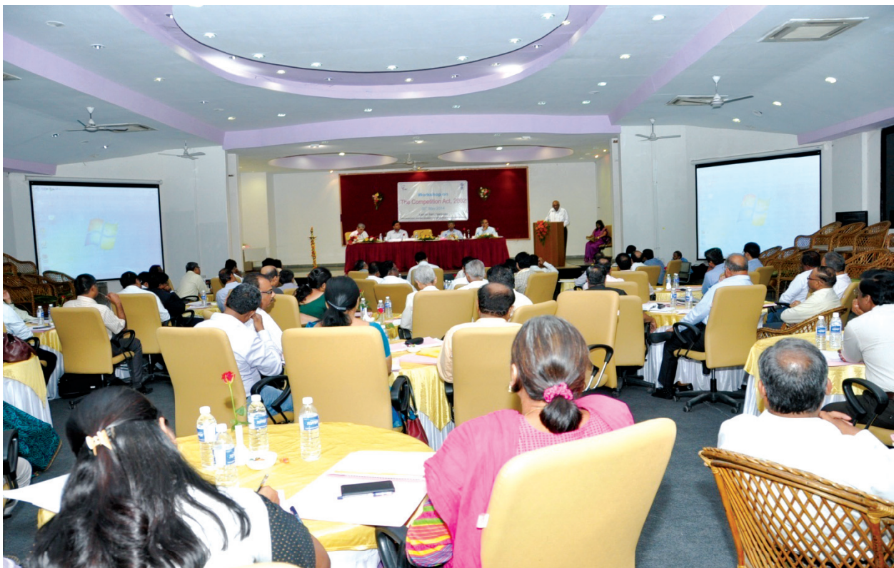
An Advocacy Programme under advocacy initiatives in progress.