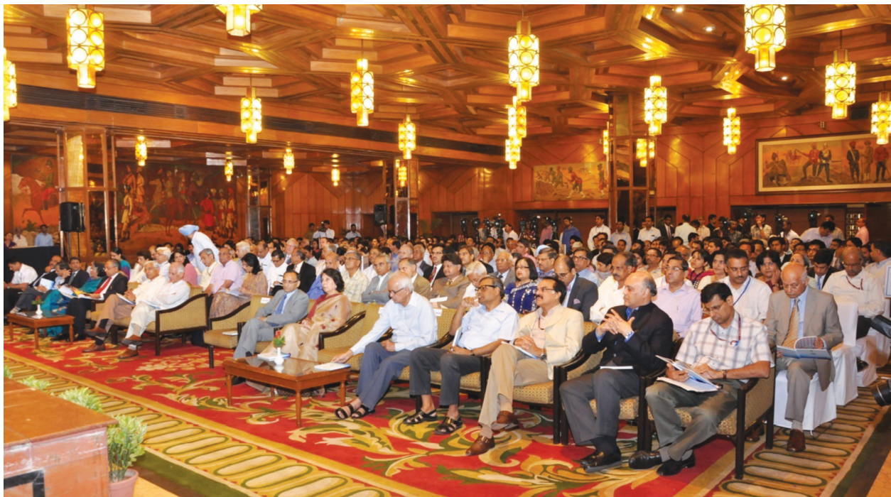
Guests attending "CCI Annual Day Inaugural Lecture, 2013, New Delhi.