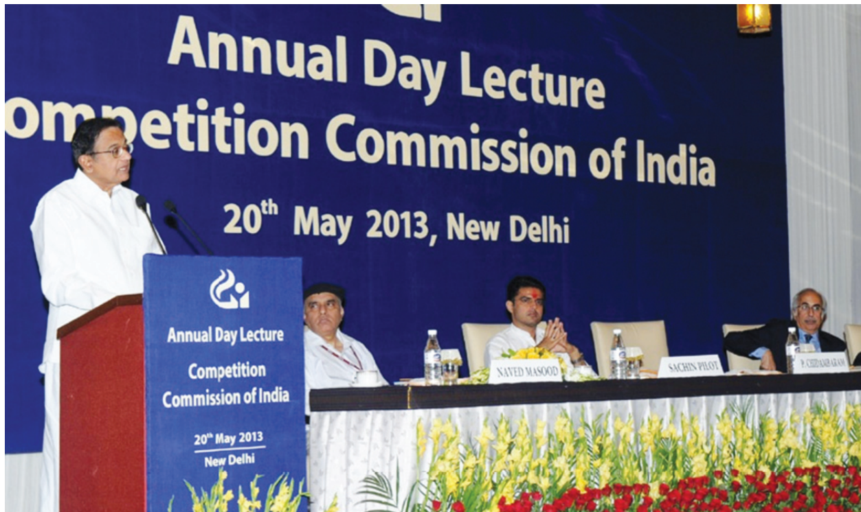
Hon'ble Finance Minister Shri P. Chidambaram delivering "CCI Annual Day Inaugural Lecture, 2013, New Delhi.