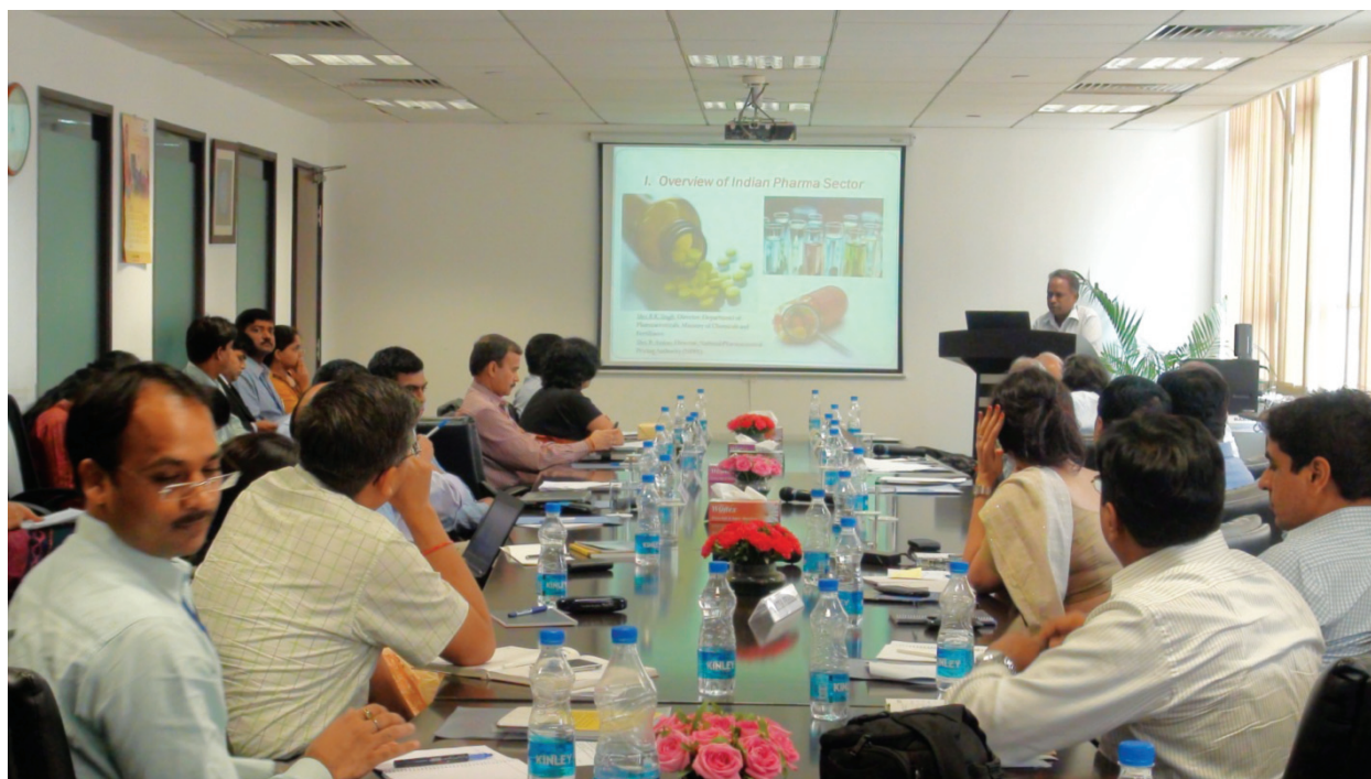
A Capacity Building Programme in progress.