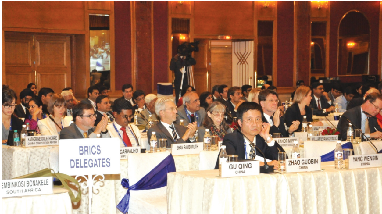
Delegates attending the 3rd BRICS International Competition Conference, New Delhi.