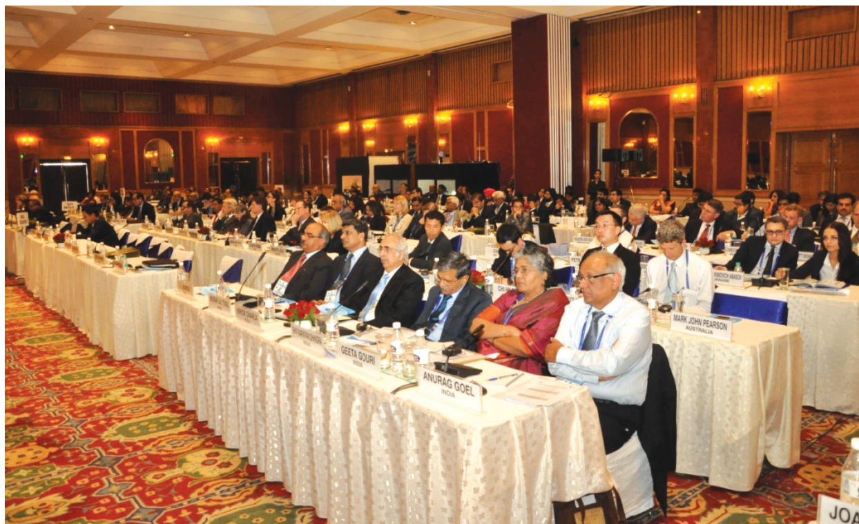
Delegates and Senior Officers of CCI attending the 3rd BRICS International Competition Conference, New Delhi.