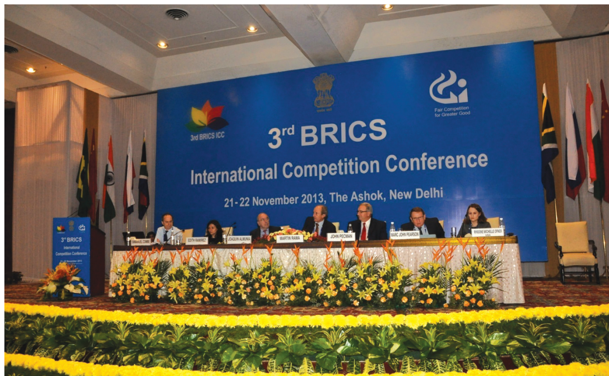
A Technical Session during the 3 rd BRICS International Competition Conference, New Delhi.

Besides, CCI is also involved in negotiation of 'Competition Chapter' in trade agreements such as Regional Comprehensive Economic Partnership (RCEP) and Free Trade Agreements (FTAs) negotiated by the Government of India.