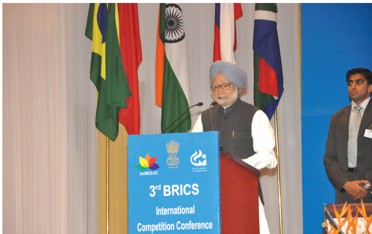
Hon'ble Prime Minister Dr. Manmohan Singh delivering inaugural address on 3 rd BRICS International Competition Conference, New Delhi.

The third BRICS International Competition Conference was organized by CCI in New Delhi during November 21-22, 2013. The BRICS Competition Authorities signed the “Delhi Accord” during the Conference which reiterates the commitment of the BRICS countries to enhance cooperation among them to meet the challenges of competition enforcement. On the sidelines of this Conference, the CCI and Director General for Competition of the European Commission (DG COMP) signed a MOU on cooperation between the EU and Indian Competition Authority i.e. CCI. CCI also signed a MOU on cooperation with Australian Competition and Consumer Commission (ACCC).