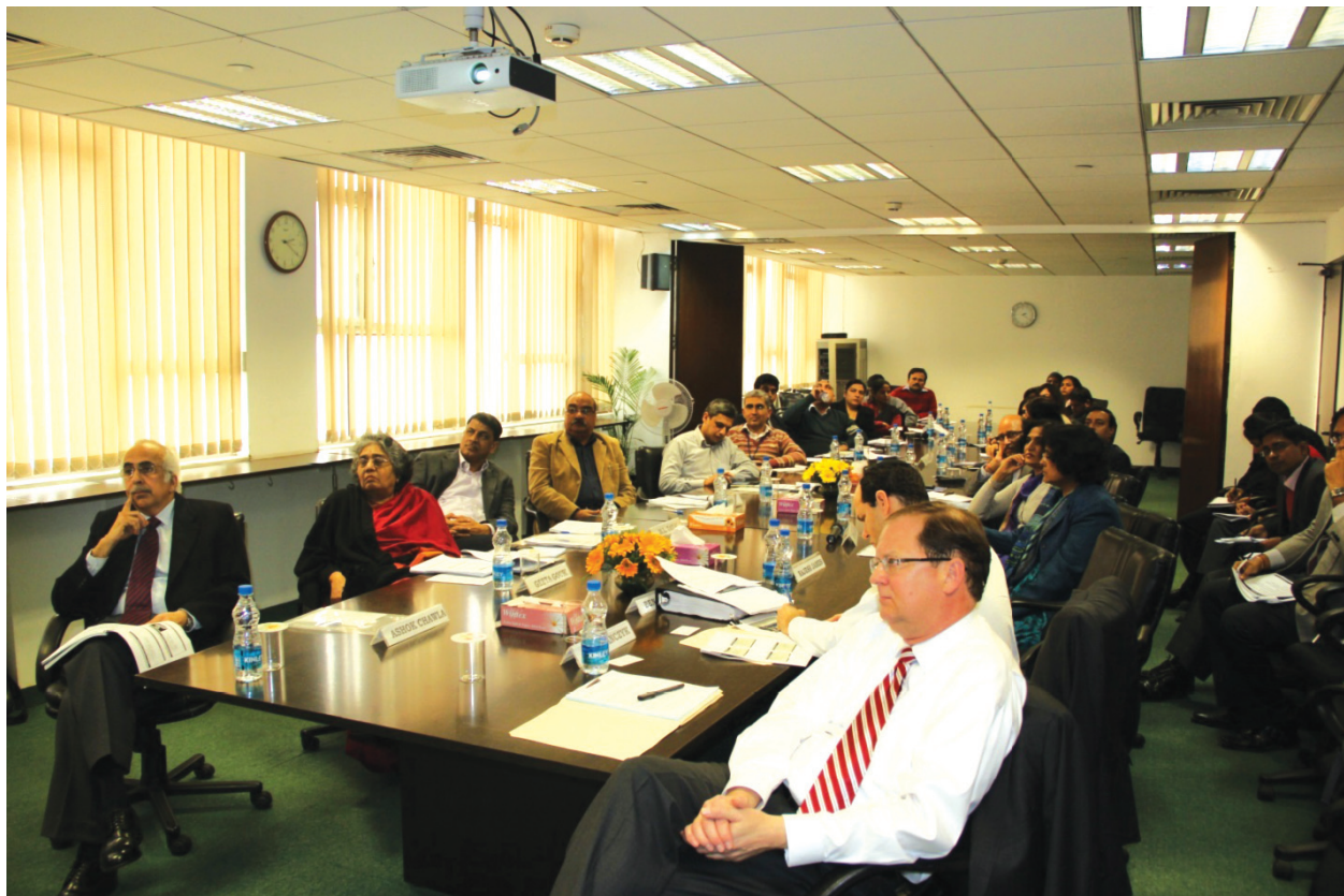
A workshop on 'High-Technology and Competition Issues' in collaboration with US Federal Trade Commission at New Delhi.